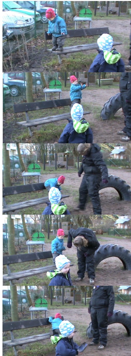
Figure 1. Walking along the bench

Then the situation turned into an instrumental situation of Measuring for the child (IC) because she wanted to get down and now had a problem to solve. The child estimated the distance to the ground and compared it with her sense of her own size and climbing capability. First, she asked the teacher for assistance